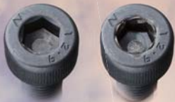
Not damaged Damaged