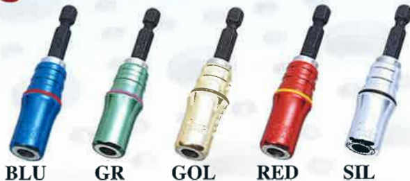
BLU GR GOL RED SIL