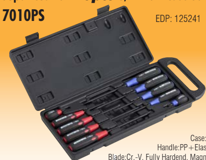
Super Cushion 10pcs S/D Blow Case Set 7010PS EDP: 125241

Case: HDPE Handle: PP + Elastomer Blade: Cr.-V. Fully Hardend, Magnetized