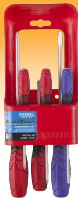
Dual Tone 6pcs S/D Hanger Case Set 4006HS EDP: 121882

Case: PP Handle: PP Blade: Cr.-V. Fully Hardend, Magnetized