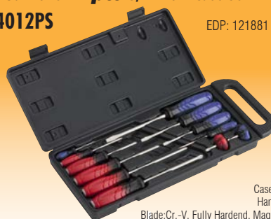
Dual Tone 12pcs S/D Blow Case Set 4012PS EDP: 121881

Case: HDPE Handle: PP Blade: Cr.-V. Fully Hardend, Magnetized