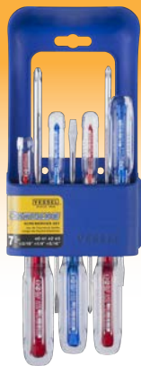
Crystaline 7pcs S/D Hanger Case Set 6307HS EDP: 121332

Case: PP Handle: CA Blade: Cr.-V. Fully Hardend, Magnetized