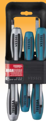
MEGADORA & IMPACTA 6pcs S/D Hanger Case Set 9006HS EDP: 122501

Case: PP Handle: PP + Elastomer Blade: Cr.-V. Fully Hardend, Magnetized